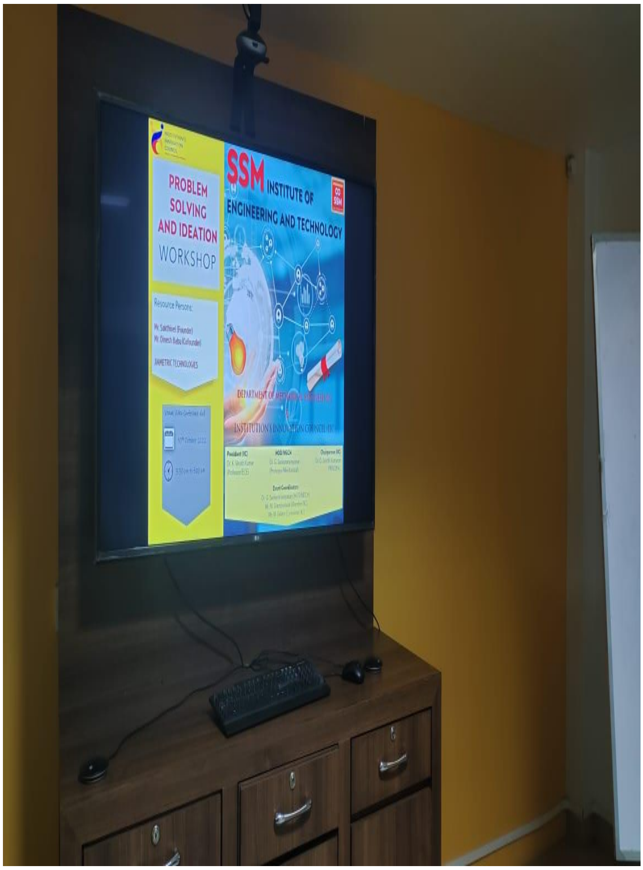
Problem Solving and Ideation workshop on 10^{\rm th} October 2022 at Video Conference Hall