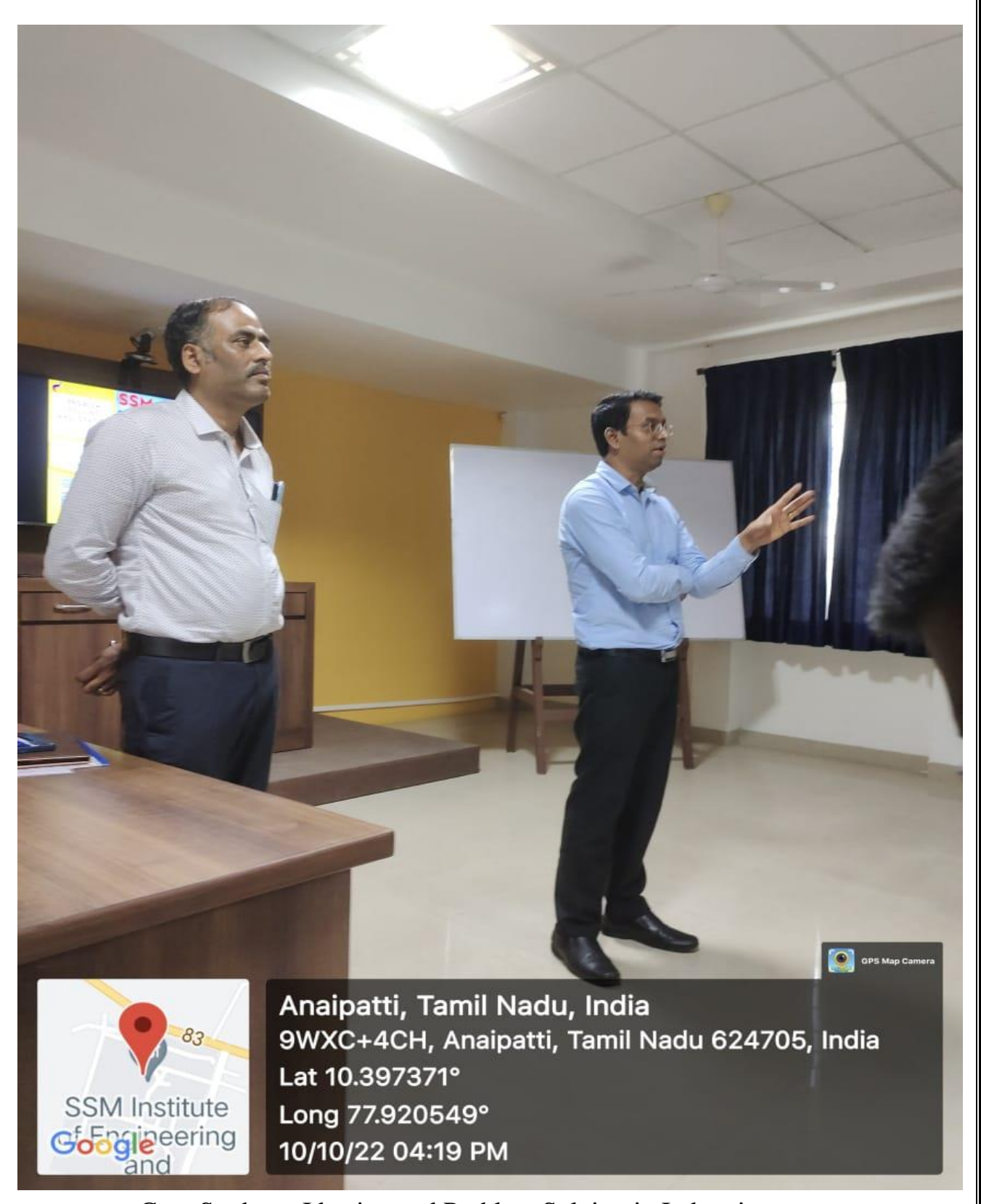
Case Study on Ideation and Problem Solving in Industries