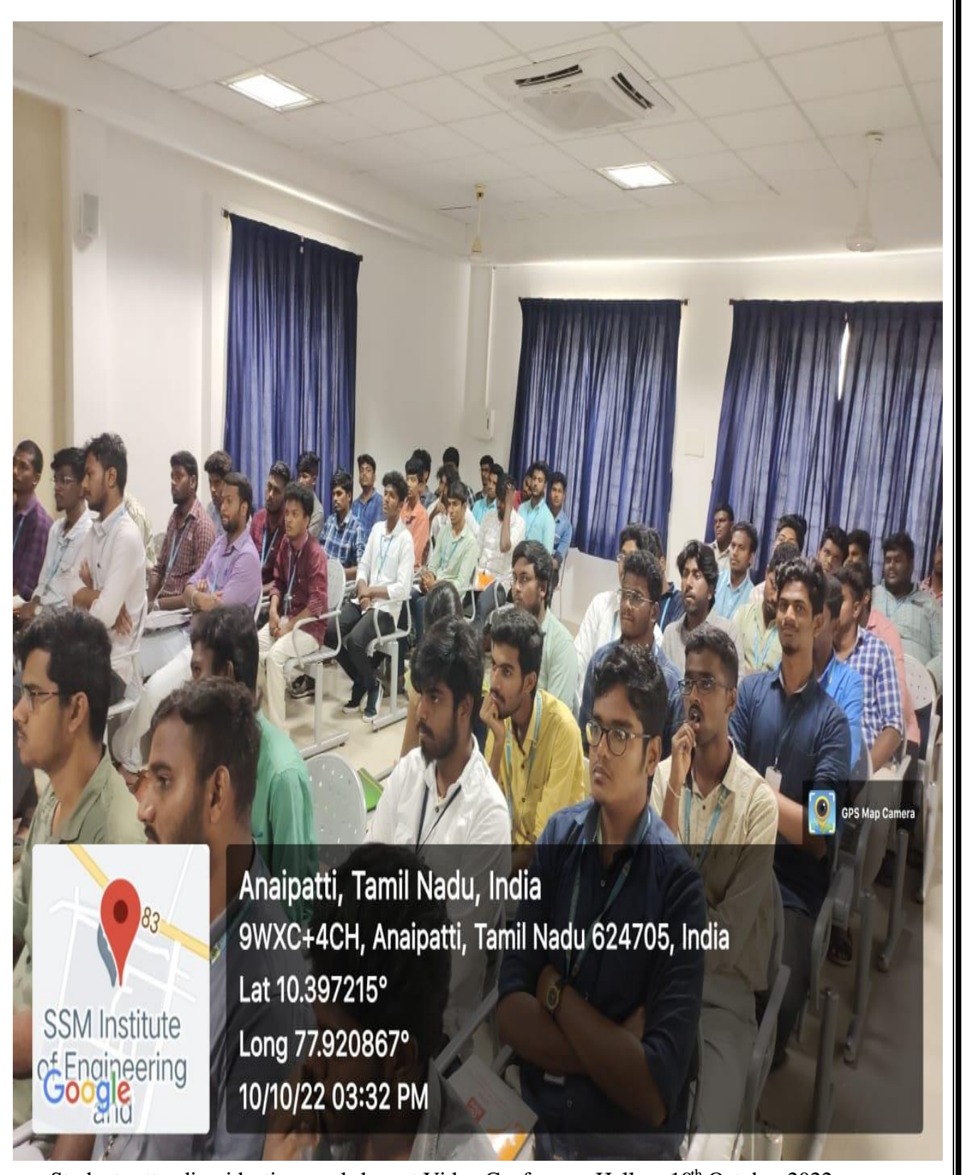
Students attending ideation workshop at Video Conference Hall on 10^{\rm th} October 2022