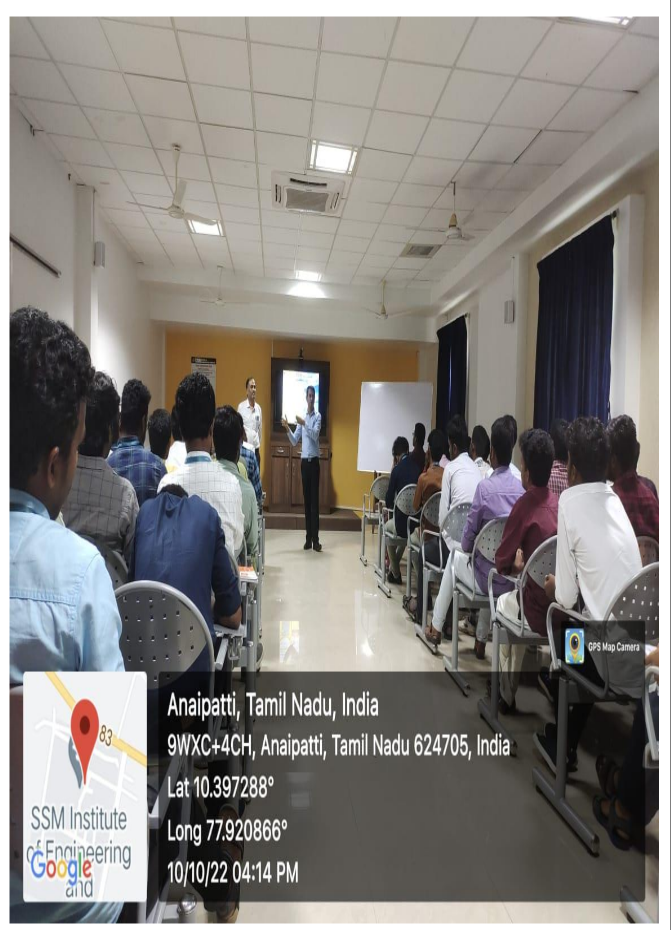
Case Study on Ideation and Problem Solving in Industries