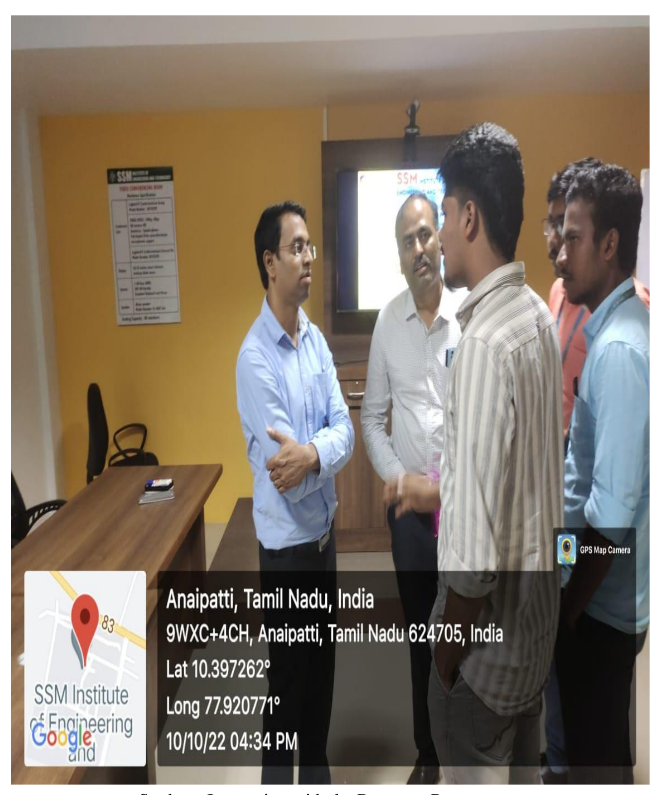
Students Interaction with the Resource Person